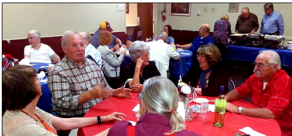
Semi-patient Norwegians waiting for dinner.